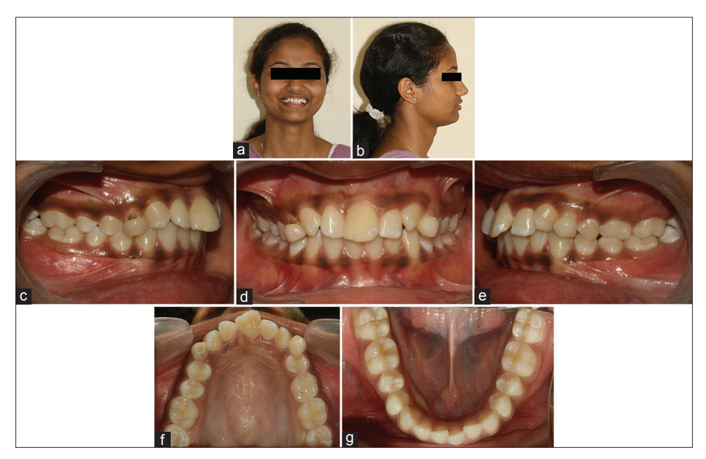
Figure 1: Pretreatment extra oral and intra oral photographs

The factors associated with anterior tooth loss include tipping of adjacent teeth, overeruption of antagonist teeth, deviation of midline to one side, masticatory impairment, speech problems, and lingual dysfunction. The conditions which are favorable for space regaining are normal intercuspation of posterior teeth with well-aligned anterior teeth, spacing in maxillary dentition, more size difference of canine and premolar. The conditions which are favorable for space closure are the maxillary crowding with balanced profile, similar size of canine and premolar, Class II malocclusion, and mild proclination of anterior teeth. The problems which