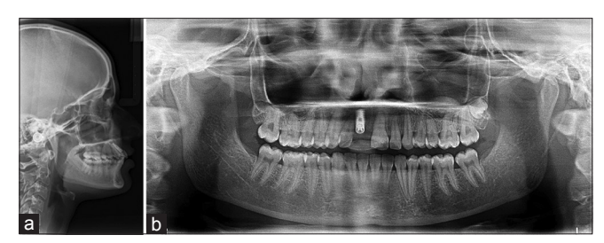
Figure 5: Post treatment lateral cephalogram and OPG

Manjunatha, et al.: Missing upper central incisor