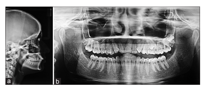
Figure 2: Pretreatment lateral cephalogram and OPG

occur when the space was closed include unaesthetic gingival margins of canine and incisor, color difference between lateral incisor and canine, crown inclination of lateral incisor and