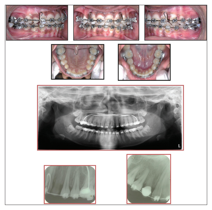
Figure 2: Midtreatment intraoral views and orthopantomogram for the assessment of the root position of 53 following space redistribution toward 13 reconstructions. Intraoral periapical views for the assessment of root angulations of 12 and 14 following crown placement (immediate)

An MBT prescription (0.022") was used to level, align, and close spaces. Maxillary and mandibular arch aligning and leveling was done with 016 round NiTi to 19 \times 25 rectangular NiTi. During the active orthodontic treatment, the adequate space was created mesial and distal to the 53, to enable us to recreate the morphology of the permanent counterpart by a crown. In addition, the retained tooth was kept under observation during the entire duration of the treatment for signs of root resorption through periodic radiological evaluations. No root resorption was observed during the period of orthodontic treatment, and there were no signs of morphological variations or deviations in the crown-to-root ratio of the tooth [Figure 2]. The cephalometric value comparison between pretreatment and posttreatment is specified in Table 1. At the end of the orthodontic treatment, the decision was made to rectify the esthetic deficits of color and gingival contour of the deciduous tooth through