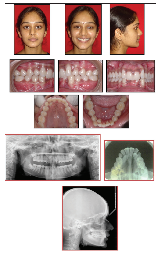
Figure 1: Pretreatment extraoral and intraoral photographs and radiographs

To achieve ideal esthetic profile and establish Angle's Class I canine and molar relation. To manage deep bite, impacted canines, retroclined central incisors, and crowded lower anteriors.