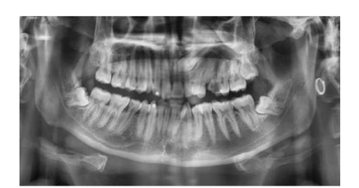
Figure 3: Demonstrates the initial and radiographic image with placement of the modified Kilroy spring on a single arch wire.

Based on the above report, it can be seen that this modification is a useful addition to an orthodontist's armamentarium and can allow for the easy guidance of an impacted tooth into its correct position in the dental arch.