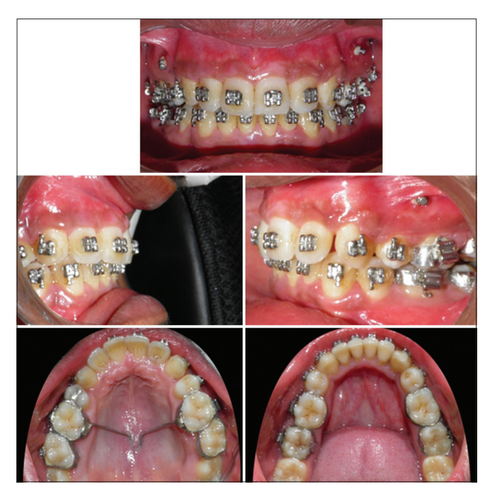
Figure 8: Intra-oral photographs case 2 taken at the end of space closure with posterior mini-implant mechanics

mandibular arch there was no change in inter-canine width, inter-premolar width and inter-molar width.