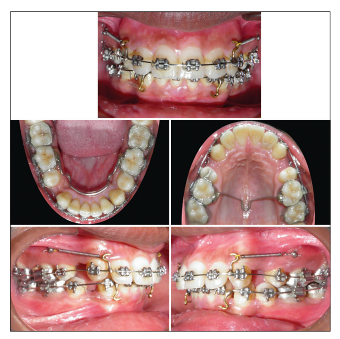
Figure 7: Intraoral photographs case 2 taken at the beginning of intrusion and intrusion with posterior mini-implant mechanics

In case I, assessment of cephalometric change showed no change in SNA, SNB, and ANB angle. There was remodeling of the maxillary and mandibular alveolar bone reflected by the backward movement of the superior prosthion and inferior prosthion by 4 mm and 3 mm, respectively. The mandibular plane increased by 2°. There was no change in lower anterior facial height. The posterior facial height decreased by 2 mm. There was decrease in articular angle and gonial angle by 2° and 1° respectively. The upper anterior teeth intruded by 2 mm. The overbite and overjet reduced by 3 mm and 2 mm, respectively, due to intrusion and retraction of maxillary anterior teeth. The lower axial inclination reduced by 8° and