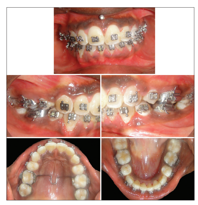
Figure 6: Intraoral photographs case 1 taken at the end of intrusion and retraction with anterior intrusion mechanics

Treatment plan involved the extraction of 14, 24, 35, and 44. Leveling and aligning were achieved. In the lower arch, spaces were closed with conventional friction mechanics. In the maxillary arch, mini-implants were placed bilaterally between the maxillary second premolar and first permanent molar. Closed coil springs that deliver 200 g of force were placed between an attachment soldered between the maxillary incisor and canine bilaterally for space closure [Figure 7a-e]. The patient was reviewed periodically every month until space closure was achieved [Figure 8a-e].