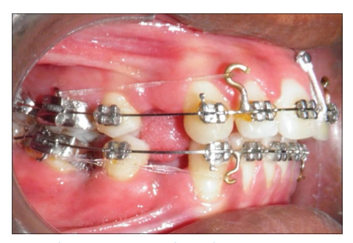
Figure 1: Showing anterior mini-implant mechanics

In the first method, 0.022" slot MBT brackets were bonded in the upper and lower arches. The arches were leveled and aligned. 0.018"x 0.025" stainless steel wire was placed. A single mini-implant was placed in the midline between the maxillary central incisors and an elastic thread placed from that mini-implant to the base arch wire to generate the intrusive force [Figure 1]. Retraction of the maxillary anterior teeth was performed with conventional friction mechanics [Figure 1]. In the anterior region, this mechanics generated an intrusive force and a counter-clockwise moment as the point of force application is labial to the center of resistance (Cres) of the maxillary anterior teeth. This counter-clockwise moment may cause labial flaring of the maxillary anterior teeth. However, this labial flaring is negated by the retractive force placed on the base arch wire. Intrusion and retraction of upper anterior teeth takes place with the intrusive force applied from the