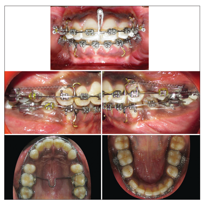
Figure 5: Intraoral photographs of case 1 taken at the start of intrusion with a single mini-implant was placed in the midline between the maxillary central incisors and an elastic thread placed from the mini-implant placed in the midline to the base arch wire to generate the intrusive force and retractive force applied with conventional friction mechanics

Treatment plan involved camouflaging the skeletal Class II pattern. As the patient had proclination of the upper and lower anterior teeth, extraction of 14, 24, 34, and 44 was contemplated. Levelling and aligning were done. Retraction of the anterior teeth was performed with conventional friction mechanics. A retractive force of 200 g was placed with a closed coil spring on 0.018" \times 0.025" stainless steel wire from the soldered attachment to the molar buccal tube in the upper and lower arch. In the maxillary arch, 60 g of intrusive force was placed with an elastic thread placed from the arch wire to the mini-implant placed in the midline [Figure 5a-e].