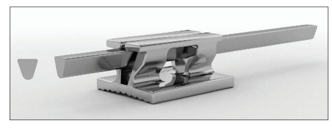
Figure 6: Design of the bracket differs in its slot geometry of a V slot and V wire. This achieves an accurate fit of the wire in the slot. Bracket allows for flexible bracket structures and the transmission of small, well-defined moments

Incognito<sup>™</sup> system (3M-Unitek, Monrovia, CA, USA) combines individualization of bracket bases, slots, and archwires to create fully customized lingual orthodontic appliances. Bracket bases are individualized to the tooth anatomy and initial position of the tooth in the dental arch. Bracket slots are customized to produce ideal tooth movement, and wires