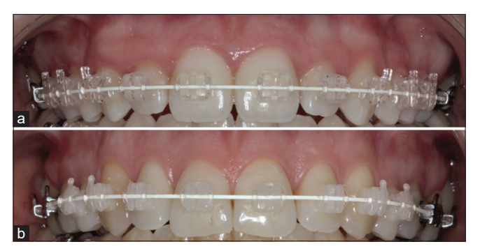
Figure 1: Intraoral image of monocrystalline (a) and polycrystalline (b) ceramic brackets

Polycrystalline zirconia brackets (ZrO), which reportedly have the greatest toughness amongst all ceramics, have been offered as an alternative to alumina ceramic brackets.<sup>[6]</sup> They are cheaper than the monocrystalline ceramic brackets but they are very opaque and can exhibit intrinsic colors making