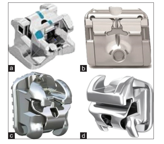
Figure 4: (a) Bio-Quick Bracket (b) Carriere SLX bracket (c) Empower 2 (d) In-ovation {\rm X}

No matter how vigorously esthetic labial brackets (e.g., plastic, polycarbonate, vinyl and ceramic brackets) or other moderately effective alternatives (e.g., Invisalign [Align Technology Inc., Santa Clara, Calif]) have been promoted over the years, many adults do not seek orthodontic treatment because of the perceived embarrassment of wearing braces.<sup>[31]</sup> To be able to serve such patients, the orthodontic community comes out with the ultimate esthetic solution – Lingual Orthodontics.