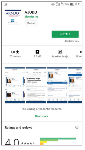
Figure 10: American journal of orthodontics and dentofacial orthopedics app

Smartphones have become an integral part of our lives making it easier and convenient for the orthodontist and the patient to access relevant orthodontic information at their fingertips. The app search carried out using two smartphones yielded a total of 354 apps related to orthodontics across both