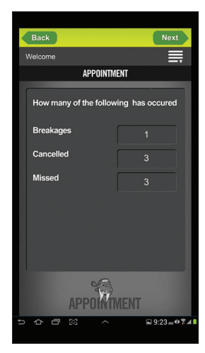
Figure 6: WAMBCO app: Appointment