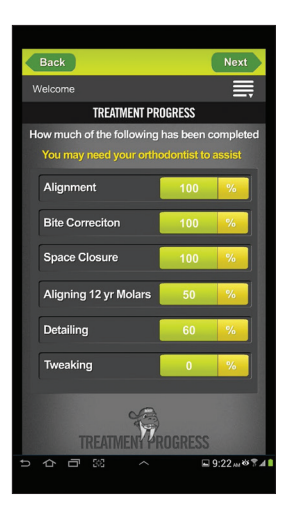
Figure 5: WAMBCO app: Treatment progress