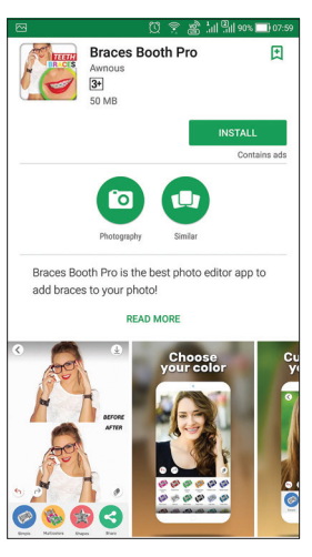
Figure 2: Braces booth pro

Another useful app in this category is the WAMBCO Orthodontic Treatment App.<sup>[3]</sup> In this app, the patient will need to enter some of information based on their treatment to estimate how long the process should take.