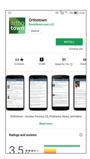
Figure 13: Orthotown app

iOS and Android platforms, out of which 44 apps were patient education apps, 202 apps were patient management apps, 25 apps were diagnostic apps, and 83 apps were updating apps.