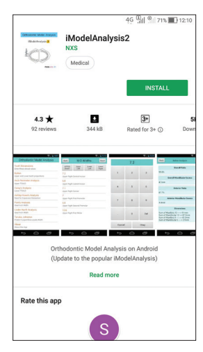
Figure 8: iModel analysis 2 app

information for the AAO annual session, winter conference, practice management materials, forms and releases, patient