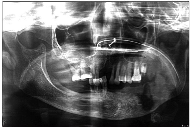
Figure 2: Orthopantomogram reveals, an ill-defined radiolucency seen on the left lower mandibular posterior teeth region, anterior border of ramus of mandible, and maxillary tuberosity area, missing teeth in relation to 14, 15, 12, 11, 21, 32, 33, 34, 35, 36, 37, 42, 43, 44, 45, 46, and 47 with chronic generalized periodontitis