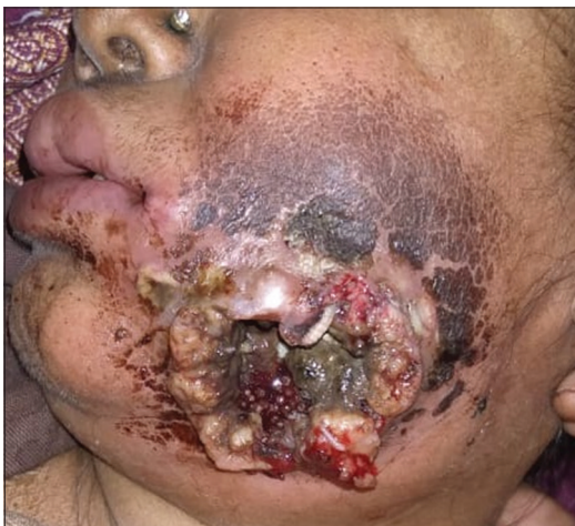
Figure 1: Preoperative picture of lesion on the left cheek region presents ulceroproliferative lesion with maggots

Myiasis with squamous cell carcinoma is a very rare condition. [1] Myiasis is diagnosed by observing the larvae in the central punctum of the lesion. [10] The maggots scrape away the tissues and lacerate the fine blood vessels while feeding. [3] During feeding from necrotic or living tissue, the caudal ends of the maggots remain visible at