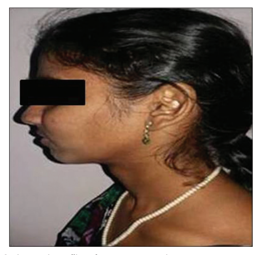
Figure 2: Lateral profile of patient revealing gross asymmetry over left middle third of face

Gorlin cyst which is, also, recognised by the synonyms calcifying odontogenic cyst (COC), calcifying cystic odontogenic tumor (CCOT), calcifying ghost cell odontogenic cyst and dentogenic ghost cell tumor, was first reported by Gorlin et al. in 1962.<sup>[2]</sup> At that time, it was classified as a cyst-related to the odontogenic apparatus. The lesion has some features which resemble a cyst while some features which are characteristic of a solid neoplasm making the lesion a little different from the rest of the lesions which more or, less have a clear classification pattern. Although it has commonly been recognized as a benign odontogenic cyst since its original description by Gorlin et al. in 1962,<sup>[2]</sup> this pathologic