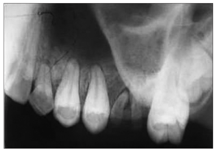
Figure 6: Maxillary left lateral occlusal radiograph revealing a well-defined periapical radiolucency extending from teeth # 22 to 26 region with root resorption in relation to teeth # 63, 24 and 25

entity encompasses a spectrum of clinical behaviours and histopathological features ranging from cystic to neoplastic to characteristically aggressive variants. This concept, called "monistic" by Toida has led some researchers to substitute the term Gorlin cyst with calcifying odontogenic cyst (COC), calcifying ghost cell odontogenic cyst, calcifying cystic odontogenic tumor (CCOT) and dentogenic ghost cell tumor in the later revisions. In addition, a "dualistic" approach has been suggested that Gorlin cyst encompasses two distinct entities as a cyst, calcifying odontogenic cyst (COC), calcifying ghost cell odontogenic cyst as well as a tumor or, neoplasm which can be benign or, malignant and/or, a combined lesion with each of the categories described above being associated with odontoma, ameloblastoma and/or, other odontogenic lesions.<sup>[14]</sup> As a result of this diversity, different classification schemes and nomenclatures for the lesion have been suggested. Gorlin cyst was renamed as calcifying cystic odontogenic tumor (CCOT) in the WHO classification for Head and Neck Tumors devised in 2005 due to its morphological diversity, histological complexity and an aggressive clinical behavior. [15] The lesion manifests either as a central or, a peripheral variant with the central variant being more common in clinical expression.