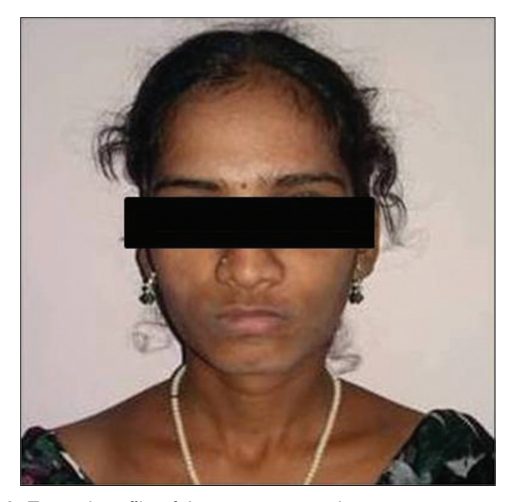
Figure 1: Frontal profile of the patient revealing gross asymmetry over left middle third of face

upper front tooth region since 6 months with a history of discomfort due to the swelling although no associated pain was reported. On extra-oral examination, gross asymmetry over left middle third of face [Figures 1 and 2] was evident, 3 × 3cms in size, hard in consistency and non-tender on palpation. On intra-oral examination, tooth # 63 was found retained while tooth # 23 was missing. Vestibular obliteration was noted in relation to teeth # 22,23,24,25 region was noted with egg shell crackling on palpation [Figure 3]. FNAC was positive yielding 3.8ml of straw colored fluid [Figure 4]. Intra-oral periapical radiograph (IOPAR) [Figure 5] and maxillary left lateral occlusal radiograph [Figure 6] revealed a well-defined periapical radiolucency in relation to teeth # 22,23,24,25 region with root resorption present in relation to teeth # 63, 24 and 25. Orthopantomograph (OPG) revealed a well-defined radiolucency in the same region with impacted tooth # 23 and root resorption in relation to teeth # 63, 24 and 25 [Figure 7]. Based on the patient's history and