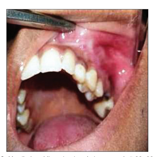
Figure 3: Vestibular obliteration in relation to teeth # 22, 23, 24, 25 region

clinical and radiographic examination, a working diagnosis of dentigerous cyst in relation to tooth # 23 was given with the list of differential diagnoses including adenomatoid odontogenic tumor (AOT), unicystic ameloblastoma and Gorlin cyst. Complete surgical enucleation of cyst was done and the specimen was submitted for histopathological examination which revealed a cystic epithelium of variable thickness along with the presence of ameloblast-like cells, stellate reticulum-like cells and ghost cells with signs of calcification along with numerous bundles of collagen fibers with sub-epithelial hyalinization confirming to a histopathological diagnosis of Gorlin cyst [Figure 8].