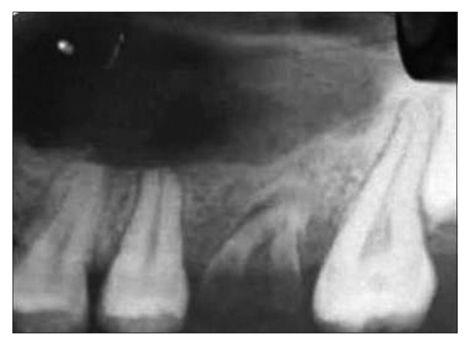
Figure 5: Intra-oral periapical radiograph revealing a well-defined periapical radiolucency with root resorption in relation to teeth # 63, 24 and 25