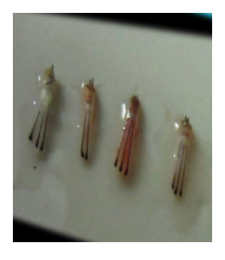
Figure 2. Follicular units