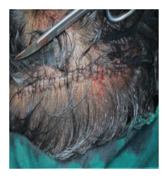
Figures 8, and 9. Follicular Unit Transplantation/strip method