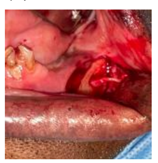
Figure 2. Exposure of mental nerve