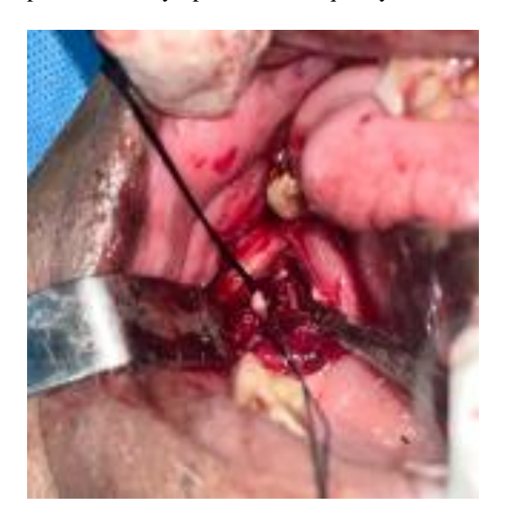
Figure 1. Exposure of inferior alveolar nerve

Under general anesthesia, Inferior alveolar nerve was approached intra orally by Dr. Ginwalla's incision and the nerve was identified (Figure 1), avulsed from the distal end. Vestibular incision in premolar region was taken; the mental nerve was identified (Figure 2) and avulsed from the mental foramen and from the soft tissues. Nerve was totally removed (Figure 3) and the wound was closed. During one year postoperative review, the patient was asymptomatic and quality of life had significantly improved.