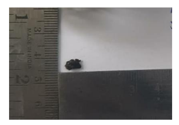
Figure 4: Grossing image showing the tissue specimen

Histopathological examination showed irregular bony trabeculae with prominent basophilic reversal lines, numerous osteocytes within the lacunae and simultaneous areas of bone formation and bone resorption. The areas of bone formation showed the presence of bony trabeculae lined by plump osteoblasts. The areas of bone resorption are seen surrounded by multi-nucleated giant cells. The intervening connective tissue stroma was fibrovascular with mild chronic lymphoplamacytic infiltrate. Areas of haemorrhage were also seen.[Fig.5]