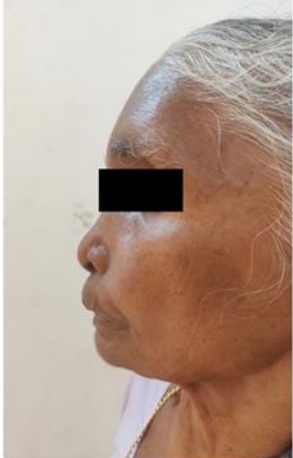
Figure.1 Extraoral clinical photographs showing diffuse swelling of the face giving a leonine facies appearance.