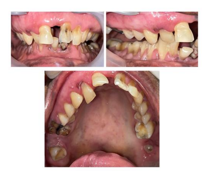
Figure.2 Intraoral clinical photographs showing cortical expansion in relation to right maxillary molar region

On radiographic examination, mixed radiopacities were evident in the skull vault, facial bones and sinus involvement, suggestive of cotton wool appearance [Fig.3]